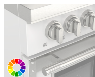
F4EIR365CS1-RAL RAL CODE