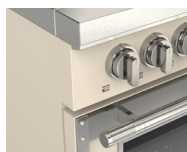
F4EIR365CS1-MI MATTE IVORY RAL 1015