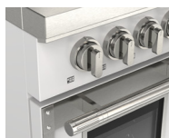
F4EIR365CS1-MW MATTE WHITE RAL 9016