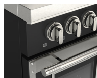
F4EIR365CS1-MB MATTE BLACK RAL 9004