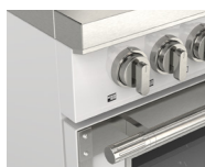
F4EIR365CS1-WH GLOSS WHITE RAL 9016