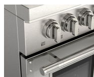
F4EIR365CS1-SS STAINLESS STEEL